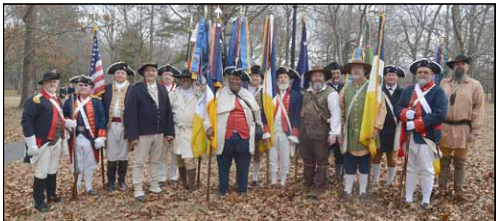
COLOR GUARD AT WASHINGTON LIGHT INFANTRY MONUMENT