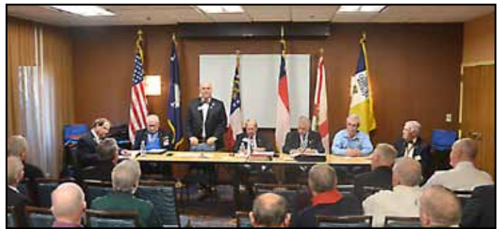
South Atlantic District meeting