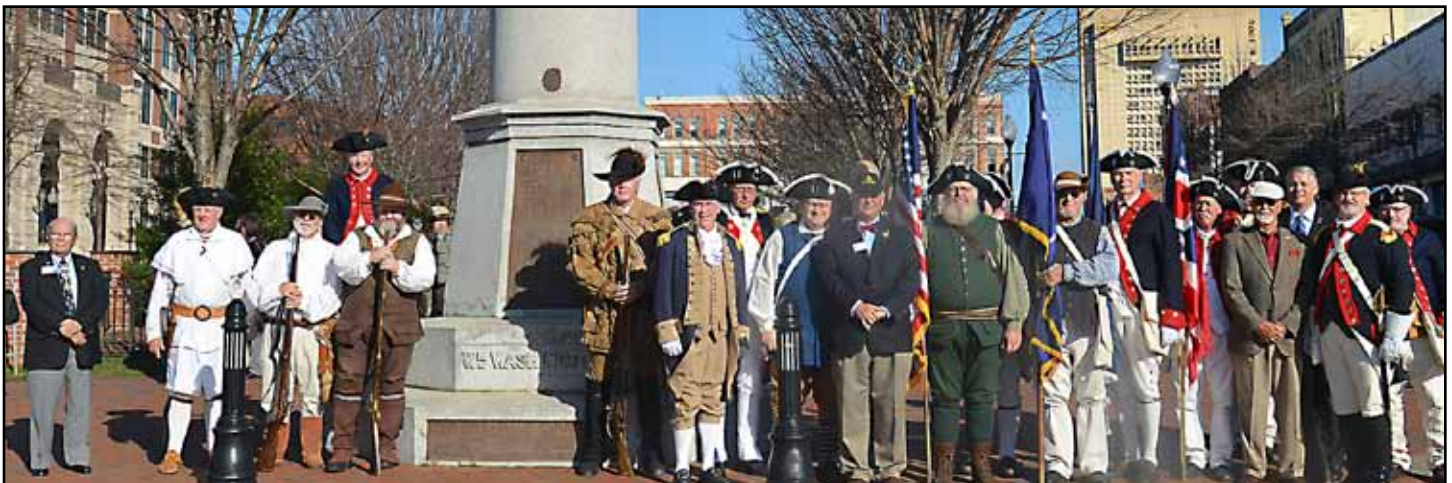
Color Guard at Daniel Morgan statue