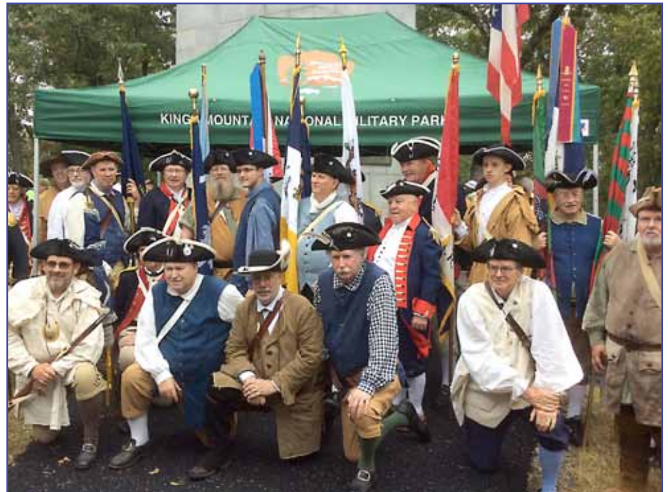
Some of the participants in the 237th Anniversary of the Battle of Kings Mountain.