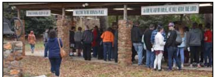
Historic Hopkins Farm