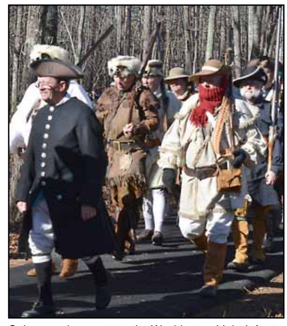
Color guard en route to the Washington Light Infantry Monument.