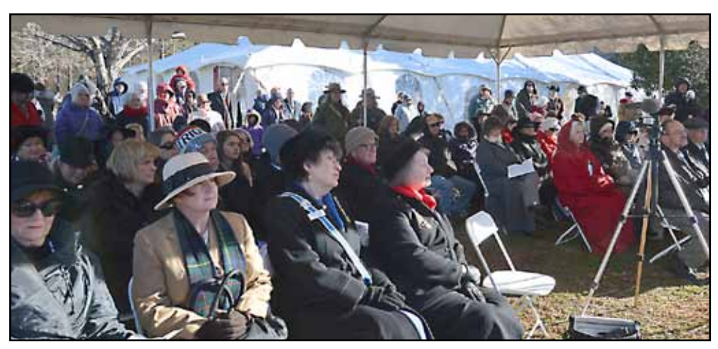
Attendees listen to Cowpens anniversary presentations