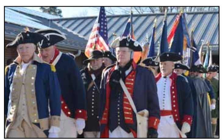
Color Guard Processional

After the official ceremonies, many Compatriots took in the lectures being offered and visited the re-enactors encampment. Others joined for lunch at Fatz's restaurant.