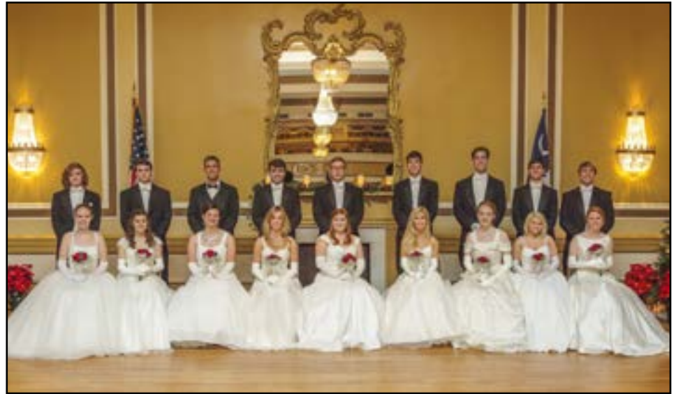
SCSSAR Debutante Class of 2017

The Colonial Ball is a formal affair. The debutantes are required to wear white ball gowns with straps (at least on half inch), while all other