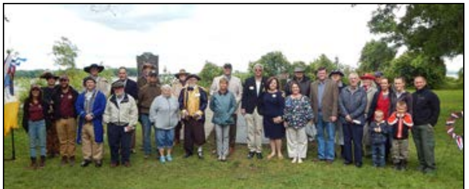
Attendees of the 238th Commemoration of the Battle of Fort Watson.