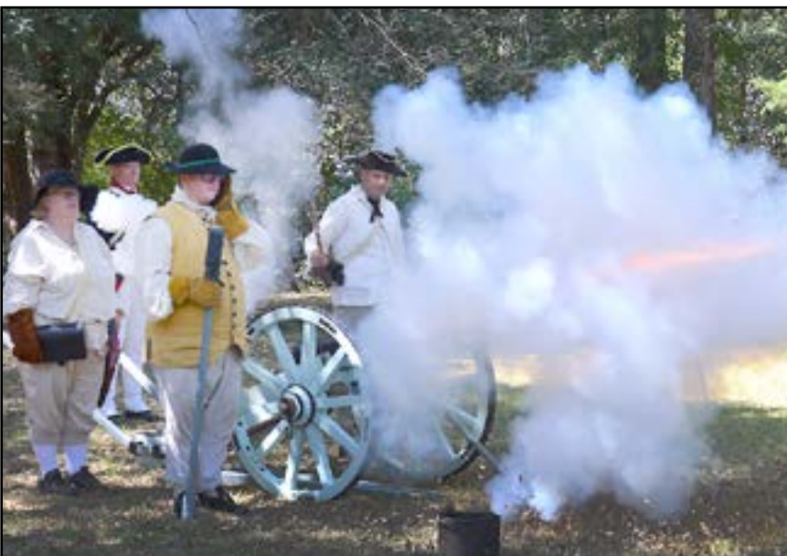
2018 Eutaw Springs event.